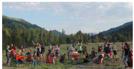
Idaho Orchestra Institute